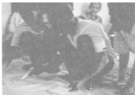
Makassar photo of brainstorming on solutions