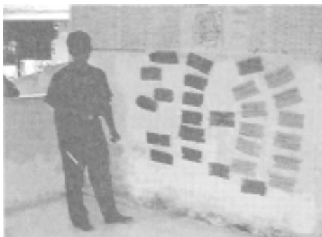
Makassar flow diagram of social safety net rice distribution in makassar