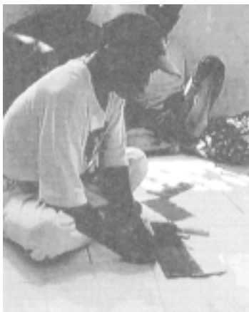
Photo of community mapping Yogyakarta